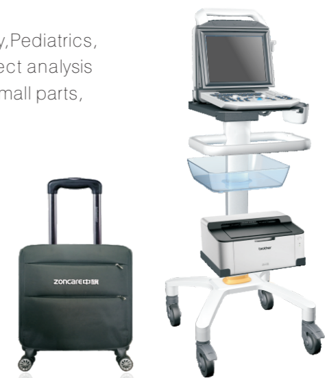
Optional trolley and suitcase